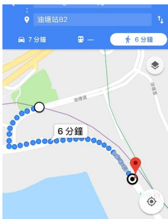
6分鐘 (500米) 經過油塘道和茶果嶺道