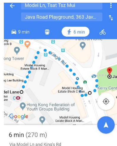
6 min (270 m) Via Model Ln and King's Rd